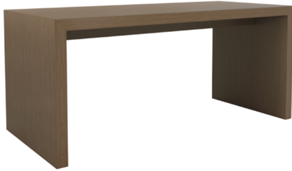
Model: LECOTBLC8436A 84W 36D 36H

The Lecco tables are completed constructed of easily cleaned and maintained Kwalu laminate material on steel reinforced frames. Lecco is available in multiple sizes and two heights, bar and counter height. An optional power grommet is centered on the tabletop and accommodates 2 power outlets and 2 USB ports. A magnetically attached panel is removable to access wires.